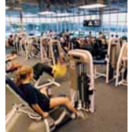
It's hard to say which is the bigger draw: the fitness center's equipment or the view of the Green Mountains.