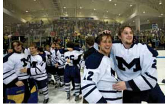
Kenyon Arena is home to men's and women's championship hockey teams.