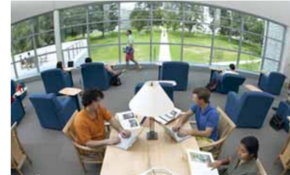
The College's library is a user-friendly campus hub, filled with every study and research tool.

The College's new library is a user-friendly campus hub, filled with every study and research tool, from the latest learning technology to centuries-old manuscripts. Designed by the noted architects Gwathmey Siegel and Associates, the library has wireless capability and more than 1 million holdings.