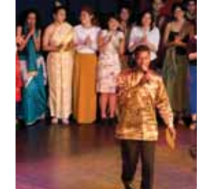
The International Student Organization stages its annual cultural show in McCullough Social Space.