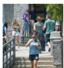
Proctor Terrace is a favorite campus gathering spot.