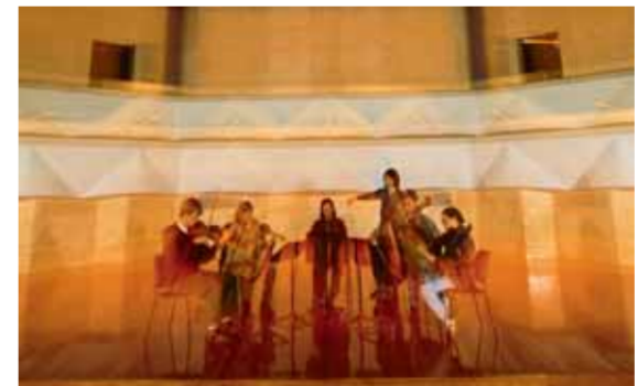
A composition class takes advantage of the CFA concert hall.