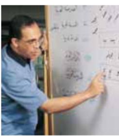
Amibic is one of nine languages taught at the College.